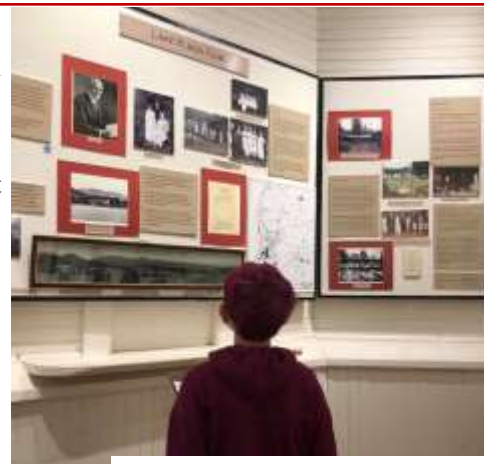
A student learning about the Lake Placid Club

We hope to make this an annual trip with the 8th grade classes!