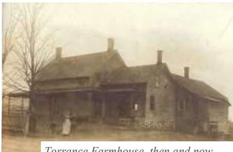
Torrance Farmhouse, then and now

This year the Historic Fall Tour explored four Lake Placid locations that have interesting pasts serving as the Post Office for Lake Placid or the Newman section of North Elba.