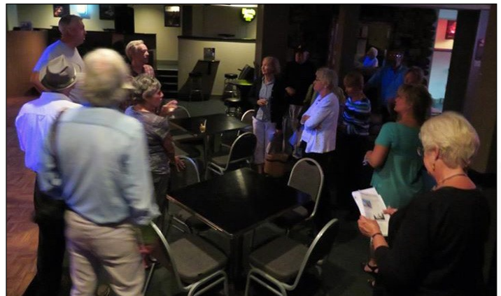
Below: Group discussion at Wiseguys