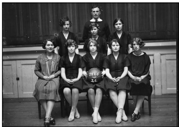
This is one of the glass plates images from the Stedman and Moses Collection. Do you know any of the players in this picture? Let us know!