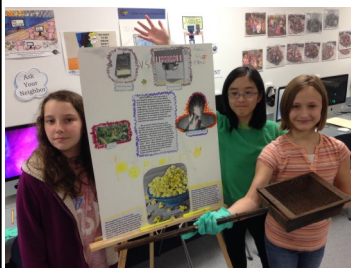
Students displaying finished projects to one another for feedback and comment

Finished projects will be displayed on a rotating basis at the museum during the 2015 season.