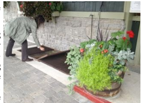
Director Jenn Tufano visiting the museum basement with consultant Gwen Spicer

After an extensive site visit, Gwen provided a lengthy report detailing measures we should take in order to provide better care for our collection into the future. Some of those suggestions included purchasing data loggers to track temperature and humidity levels, re-arranging stored collections, purchasing different shelving units and storage boxes, purchasing a HEPA vacuum to keep down dust and allergens, and wrapping the freight house in a protective membrane. We are taking these suggestions very seriously and are making plans to implement some measures this season.