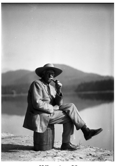
Who Am I?

This special wall is interactive and changing. As images are identified, each will be replaced with a new image to identify. We intend to continue this activity over the next couple years in hopes of putting as many names to things as possible.