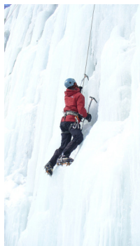
Ice climber. Are you brave enough?

By the late 1800s many settlers had returned to Lake Placid and the boom years of hotels began. Ice was used to decorate the Village with various sculptures in front of homes and businesses. Olympic Arena employees erected a lighted ice wall around the front driveway. Each February the high school held a competition in which students designed sculptures and used brawn and shovels to build them.