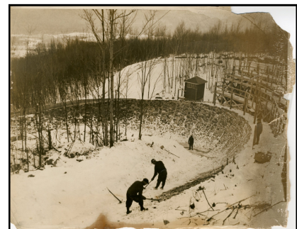
ITEM ON EXHIBIT THIS SPRING!

This item is part of our new ICE! exhibit—come see for yourself!