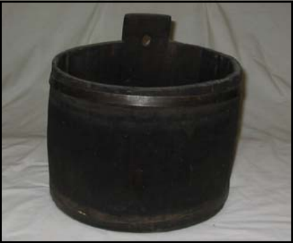
Sap Bucket: objects like the Sap Bucket are important elements of our collections.