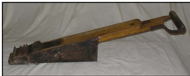
Above: Corn Planter , this turn of the century object is another example of varied collections, which include print, photographic, and artifacts of all varieties. For the Lake Placid-North Elba Historical Society, our collections are our most priceless asset, the basis of our mission and the foundation of our future.

The Cornerstone Project is expected to be a two year process with a cost of $120,000. The Lake Placid Education Foundation and Uihlein Foundation each provided grants in the amount of $40,000, with the requirement that the Historical Society raise a match of $40,000. The Board of Trustees contributed half this amount with 100% participation. The remaining $20,000 has been contributed by committed Historical Society members and businesses in the community. We are continuing to raise funds for the project and hope you will consider making a contribution to support this giant leap in our institutional capacity.