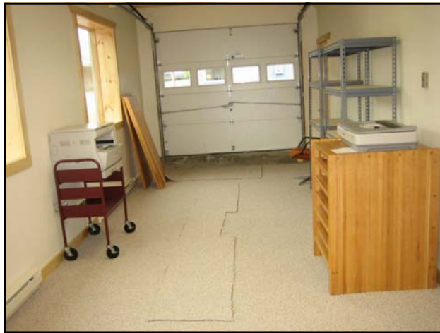
Above: loading door, Below: photo's of our newly renovated workspace across from the History Museum.