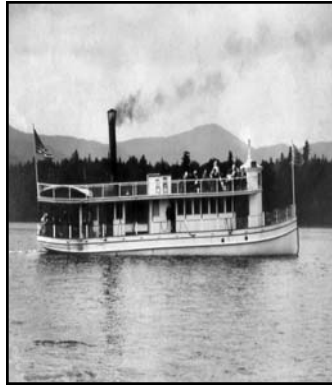
Above: The Doris I, after many years of service the Doris II was retired this year.

As we open for the season we will again be collaborating with the Lake Placid Institute to host their "24 hours in the Adirondacks," a high school photography competition. Students throughout the Adirondack Park compete and their